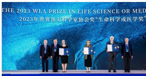
The awards ceremony for the WLA Prize in Life Science or Medicine