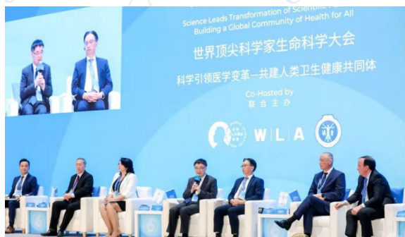
The routable of the WLA Life Science Forum

Science Forum, which convened on November 7, 2023, included a dozen world-renowned scientific award recipients, CAS and CAE members, eminent scientists, representatives from leading global hospitals, medical policy experts, and hospital management specialists. They held in-depth discussions on the transformation and advancement of future medicine, new drug research and development, and diagnosis and treatment of major diseases. Together, they crafted a vision for a global community of health for all.