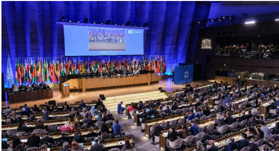
The 42nd session of the UNESCO General Conference

From November 7 to 22, 2023, the 42nd session of the UNESCO General Conference was held in Paris, France. The conference voted to approve a proposal from CAST to commemorate the 1800th anniversary of the birth of Liu Hui, a Chinese mathematician.