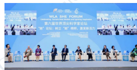
The roundtable of the WLA She Forum

nized by WLA and the China Women's Association for Science and Technology (CFAST), was themed "Celebrating Female Role Models and Igniting Inspiration," with the primary goal of inspiring and promoting the active involvement of more women in the forefront of scientific endeavors.