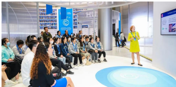
Young scientists at the WLA HUB event

One of WLA's central missions is to nurture the growth of young scientists. This year's WLA forum brought together over 120 young scientists from more than 25 countries and regions. Their research capabilities, coupled with their enthusiasm, ignited a fresh wave of youthful energy at the event.