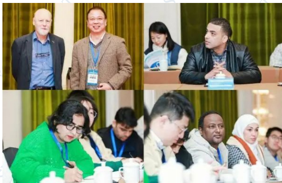
Young scientists at the CAST International Young Scientists Salon on Photonic Crystal Optical Fiber