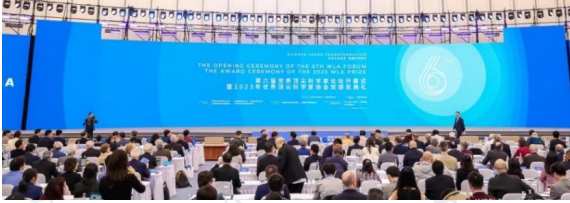
The opening ceremony of the 6th WLA Forum

On November 6, 2023, the opening ceremony of the 6th WLA Forum & the Awards Ceremony of the 2023 WLA Prize was held at the Lin-gang Center, the permanent venue of the WLA Forum in Shanghai. The event, co-hosted by the World Laureates Association (WLA) and the China Association for Science and Technology (CAST), brought together over 300 eminent scientists from 25 countries and regions including 27 Nobel laureates, 40 members of the Chinese Academy of Sciences (CAS) and of the Chinese Academy of Engineering (CAE), and 120 young scientists from China and abroad. CAST President Wan Gang attended the opening ceremony and